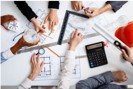
Design & Engineering

Geospatial, BIM (design authoring), Engineering analysis, Digital Twin, Project controls, VDC, Reality capture, Immersive experience, Building management system, trainings and hand-holding services are available from BIM & digitalization service provers. These services are offered as one stop solutioun